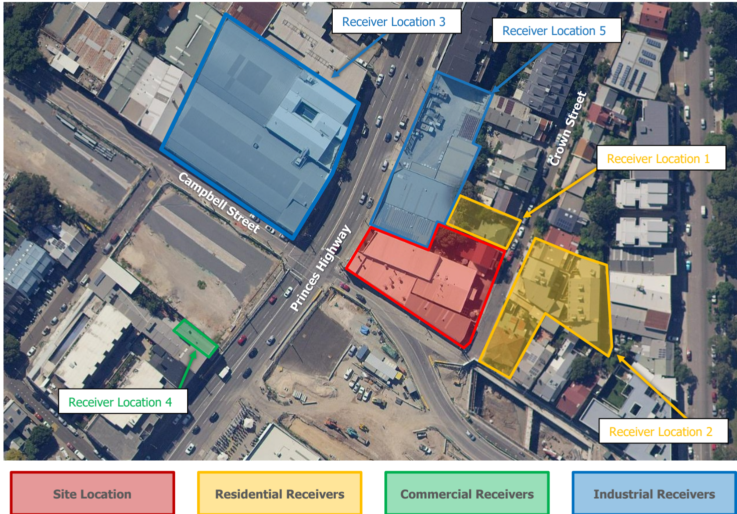
Figure 1 Site Location and Surrounding Receivers