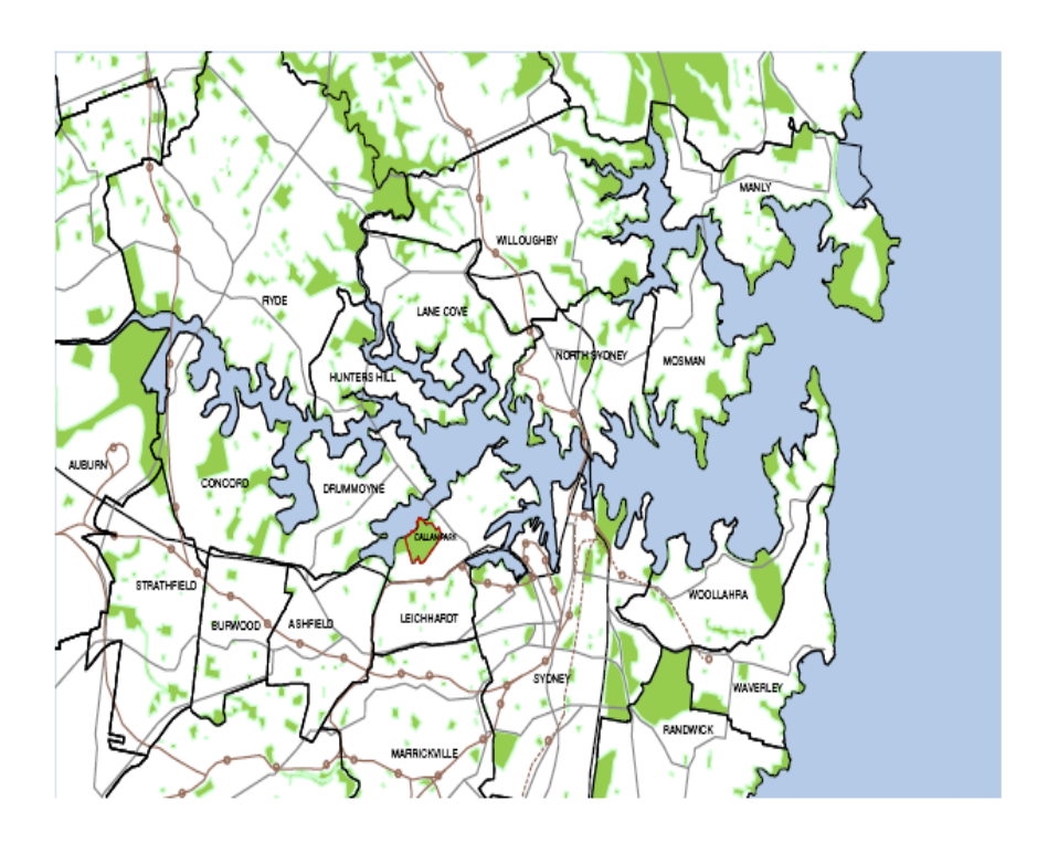
Figure 1.1 Location of Callan Park

This Plan of Management applies to Callan Park on the waterfront of Iron Cove at Rozelle, which occupies an area of 61 hectares.