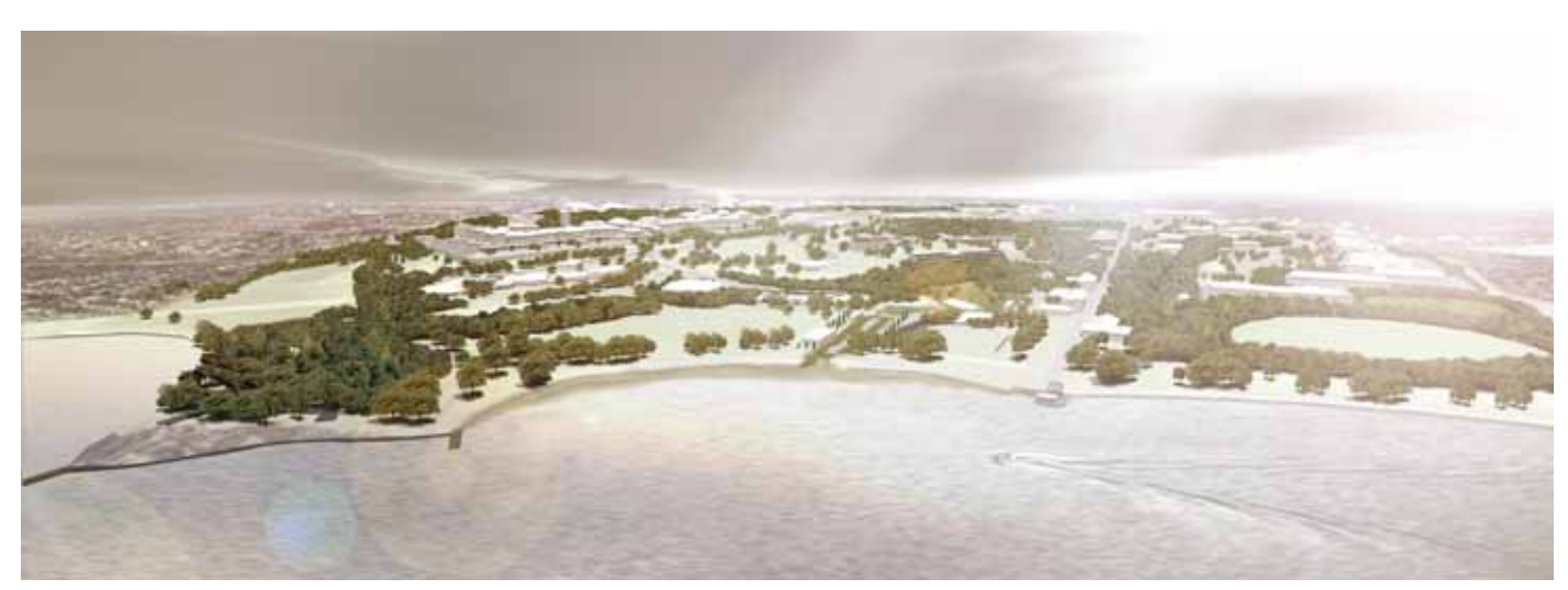
Callan Park Plan Of Management