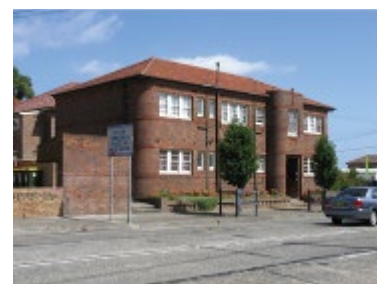
Inter War “Austerity” Style – lace brick