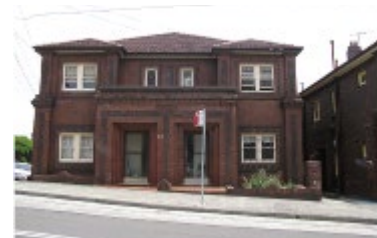
Inter War Stripped Classical