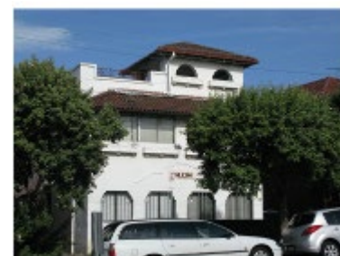
Inter War Spanish Mission