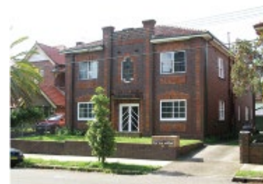
Inter War Art Deco – lace brick