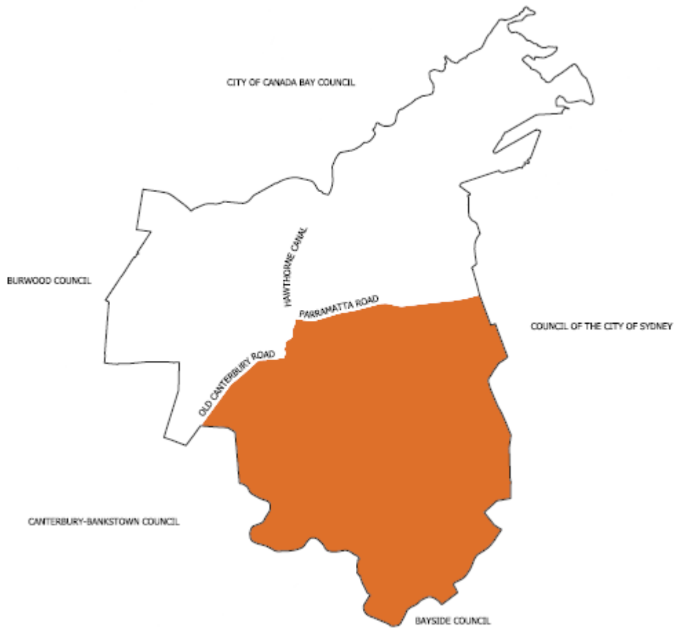
Figure 1: Extent of land