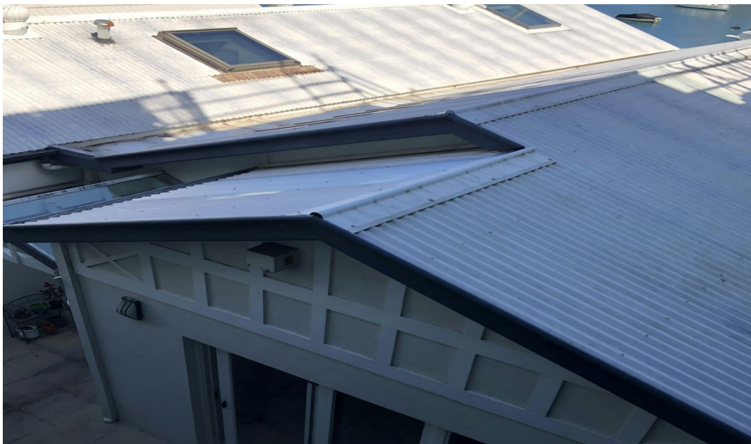
Figure 4 – Site inspection view from the ground floor of the subject site over skylights to 97a Louisa Road.

With regard to overlooking into the 4 skylights to the roof of 97a Louisa Road from the proposed two terraces on the ground and first floor, these terraces are being rebuilt to the exact location, R.L and size as per existing dwelling and as such no new privacy impacts are created as a result of the proposed development. (See figure 4.)