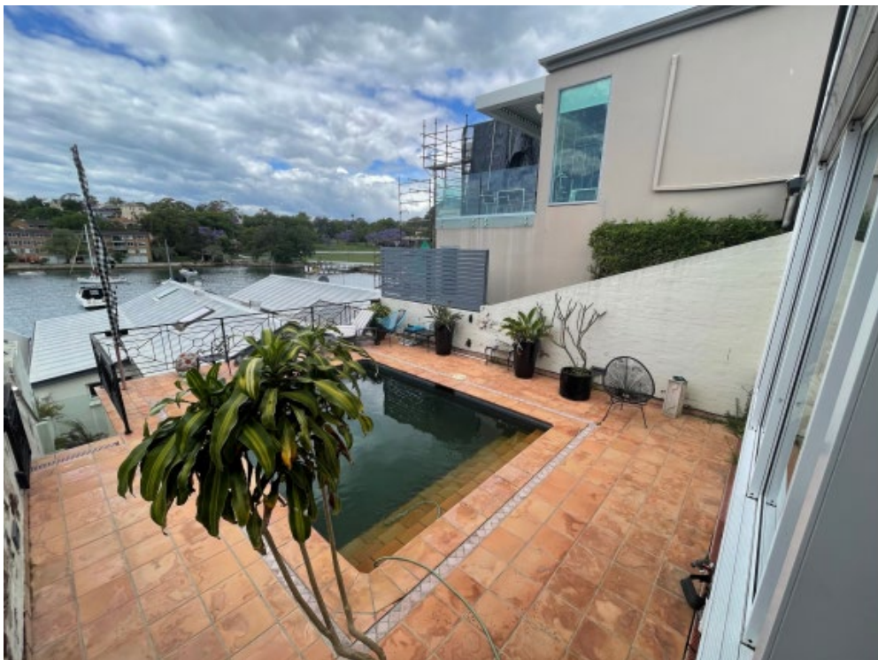
Figure 2 – view from pool area (97a) looking southeast to the elevation of no, 95 Louisa Road

Comment: 97a Louisa Road have acknowledged that their pool area is currently overlooked by the subject site and expect that the redevelopment of the site is an opportunity to remedy this. With regard to this, it is considered that the proposed design does in fact reduce unscreened window elements to the eastern elevation – see figures 2 and 3.