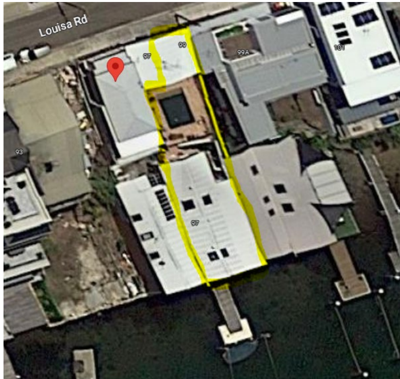
Figure 1 – 97a Louisa Road

The matters that were addressed in the assessment report addressing the objection prepared by 1/97 Louisa Road, are quite similar as both dwellings are located to the lower foreshore of Snails Bay to the southeast of the subject site. The difference of the two dwellings is that 97a Louisa Road has an elevated Private Open Space (POS) containing a swimming pool and paved area to the north of the site, see figure 1 below.