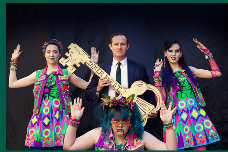
Dweeb City with Darcy Byrne, Inner West Mayor. EDGE Sydenham 2019

Follow the Creative Trails self-guided map, book a guided tour or workshop to explore an underground world of makers, machines and warehouses buzzing with artist spaces, studios, performers and producers.