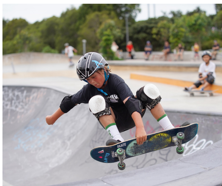
Matej Hakl © Haklography

Featuring The Soul Movers, Dorothy the Dinosaur and local bands. Sample local products and food. Meet local heros at the SES interactive hub.