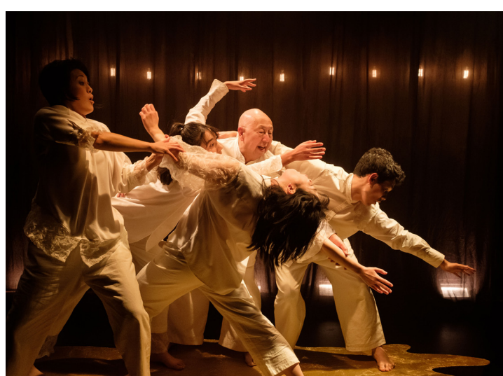
Moon Rabbit Rising © Clare Hawley

Visit the website for program and bookings.