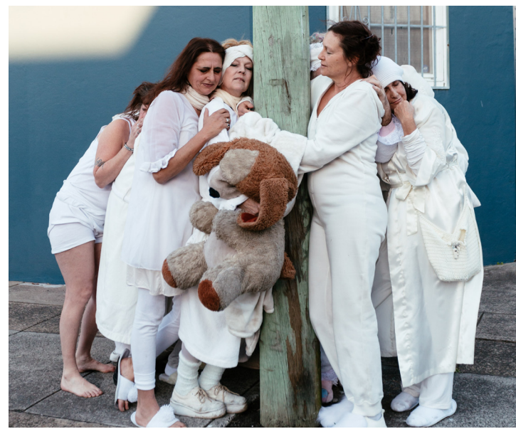
The Sleep Walkers © Daniel Kukec

Follow the self guided map or book a tour.