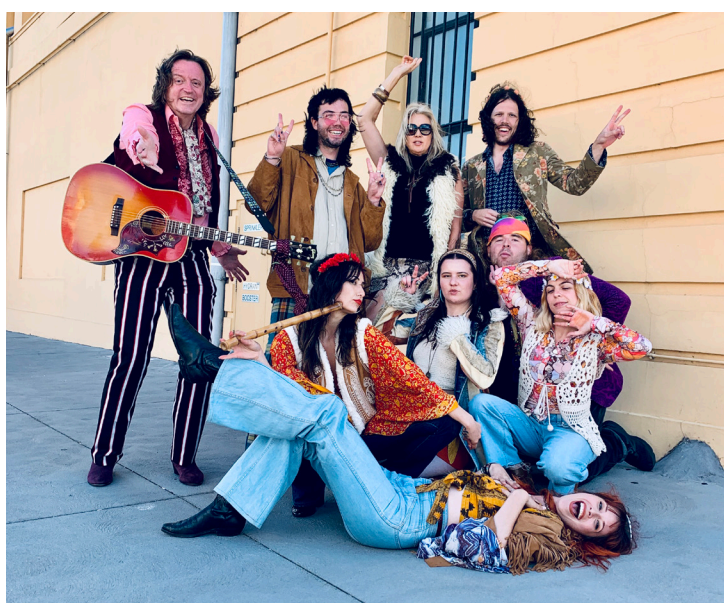
The Soul Movers

Visit the website for program and bookings.