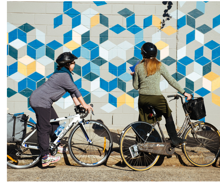
Creative Trails Tours

Visit the website for program and bookings.