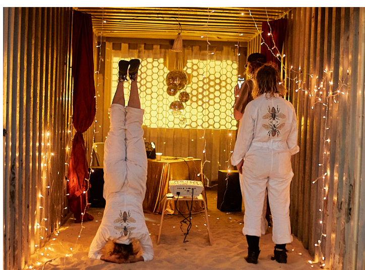
Superorganism © Shane Rozario

Explore Tortuga Studios apocalyptic night playground - GLITCH. With fractured light, warped sound and large installations, this multimedia event features Sydney's leading industrial artists, performers and live musicians. Do you dare to come and play?