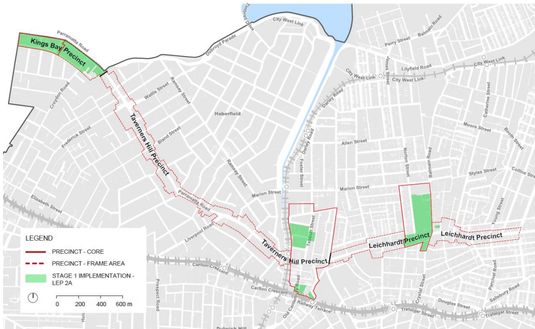
Figure 2 - Map showing the land within Council’s Stage 1 of PRCUTS Implementation

This Stage 1 Planning Proposal implementation area was identified by Council to address the DPE’s requirement to deliver a short to medium term shortfall of up to 1600 dwellings in the Inner West, and to ensure that development occurs in line with the timely delivery of infrastructure.