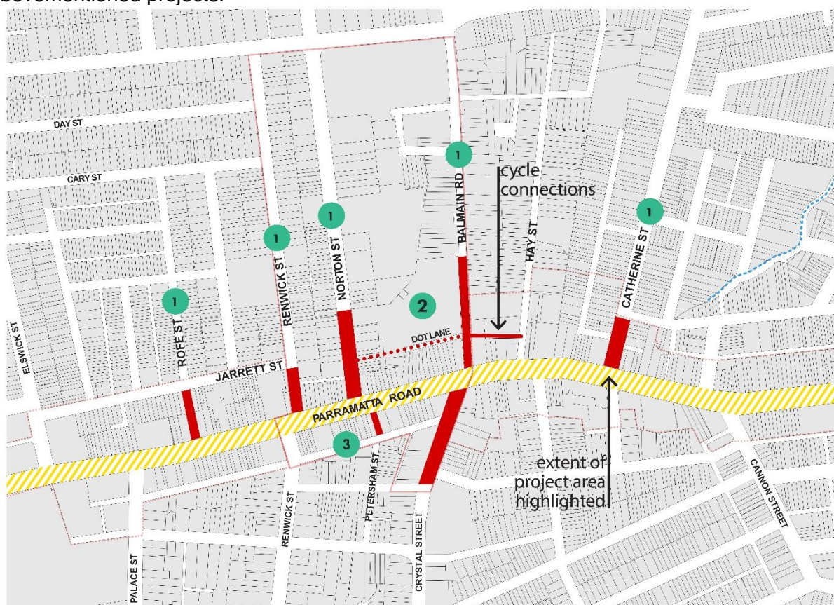
Figure 3 -Location of Leichhardt precinct UAIP works

See Figure 3 Error! Reference source not found. below which identifies the location of abovementioned projects.