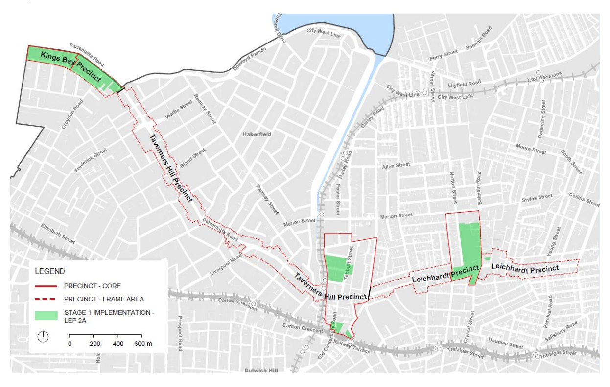
Figure 2 - Map showing the land within Council's Stage 1 of PRCUTS Implementation

This Planning Proposal deals with the following parts of Leichhardt, Taverners Hill and Kings Bay precincts in the Parramatta Road Corridor.