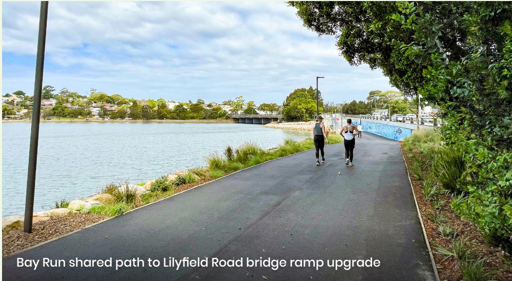
Bay Run shared path to Lilyfield Road bridge ramp upgrade

“With new lighting, path improvements and our Leichhardt skate park all nearing completion, the Bay Run is set to be better than ever.”