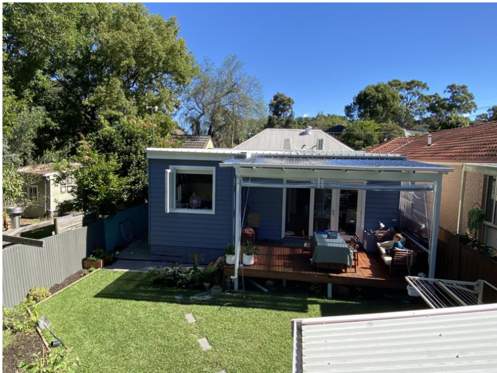
Fig3 Unobstructed view into the rear of [redacted] Hercules St