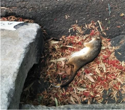
Photo A Ringtail