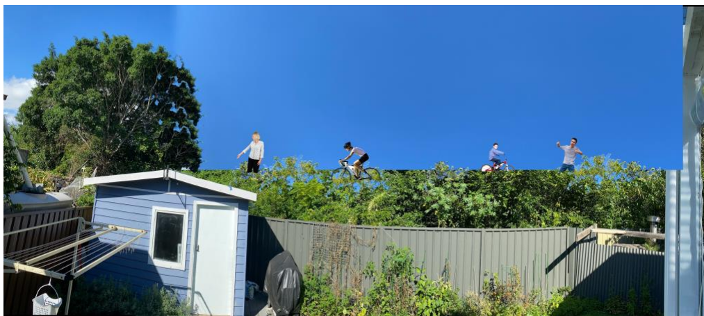
Fig 2. Proposed clearing