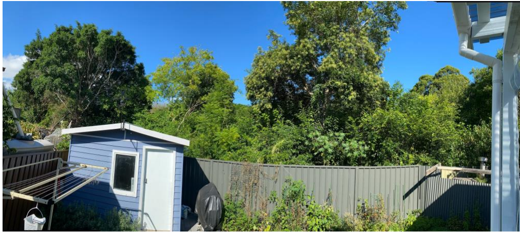
Fig 1. Current state of vegetation