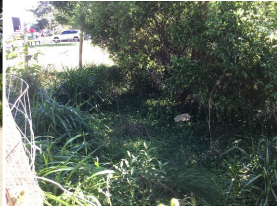
Photo B: Jubilee Park Glebe – without fencing Photo C: The other side for the path with fencing