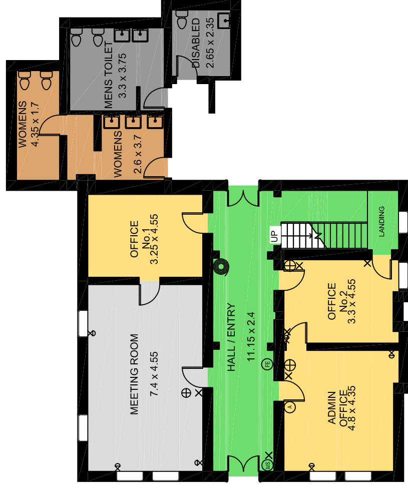
GROUND FLOOR PLAN "ANNANDALE NEIGHBOURHOOD CENTRE"