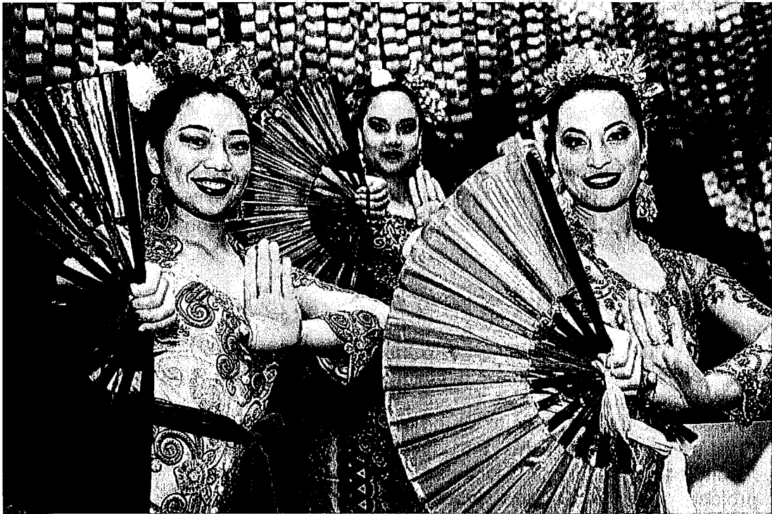
Suara Indonesian Dance at EDGE Ashfield, September 2018