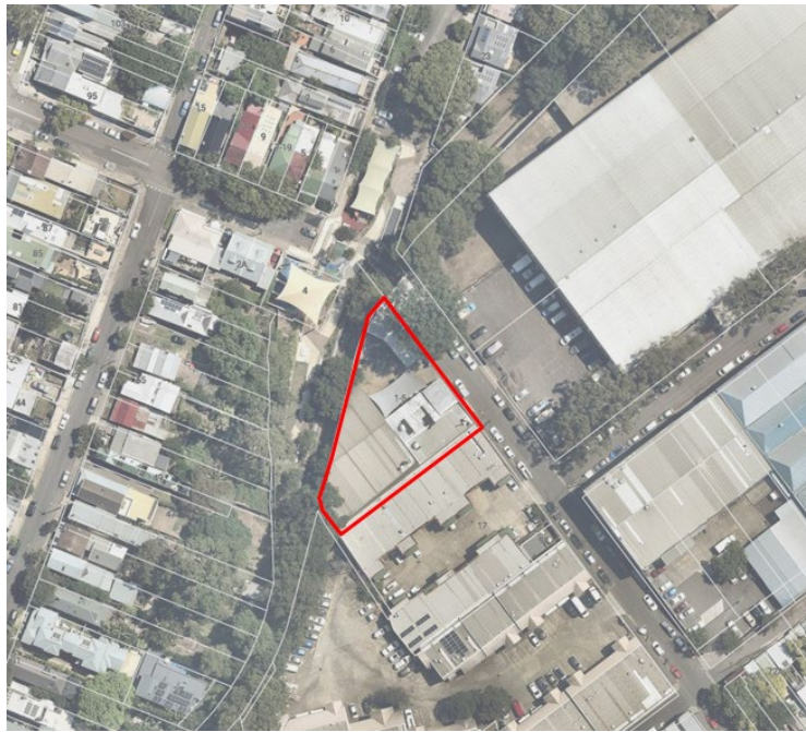
Figure G53: The site