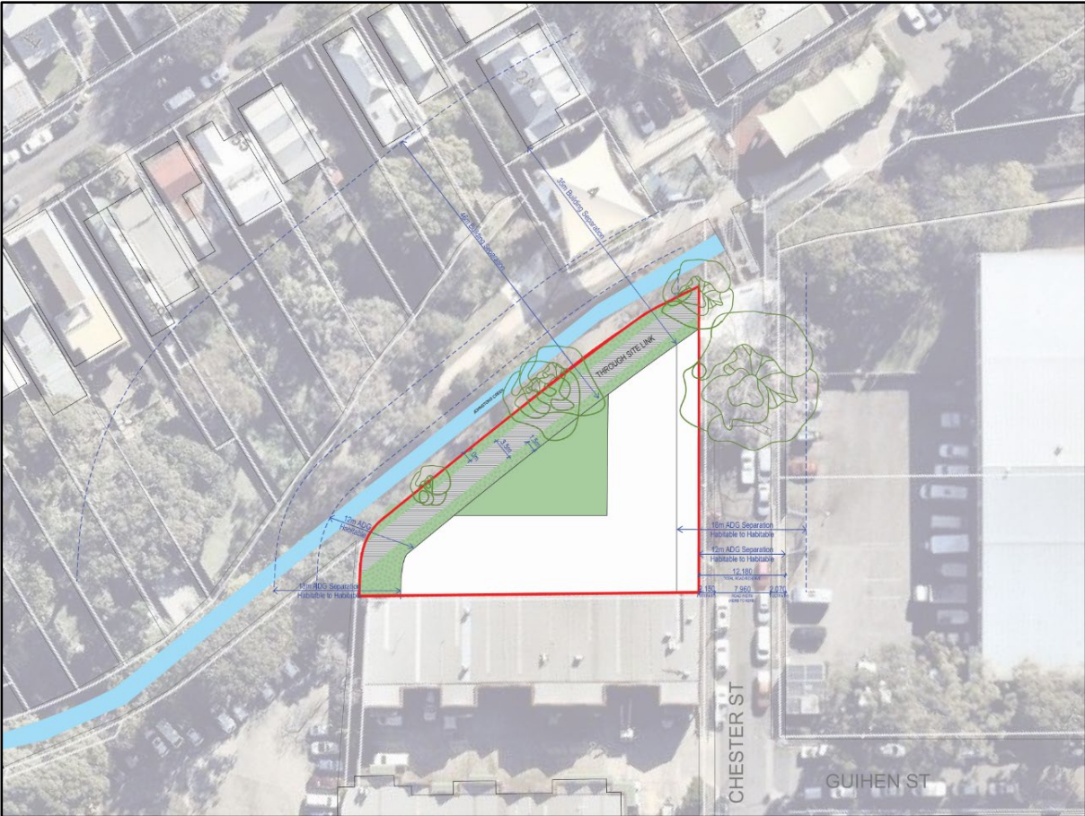
Figure G54: Indicative site plan