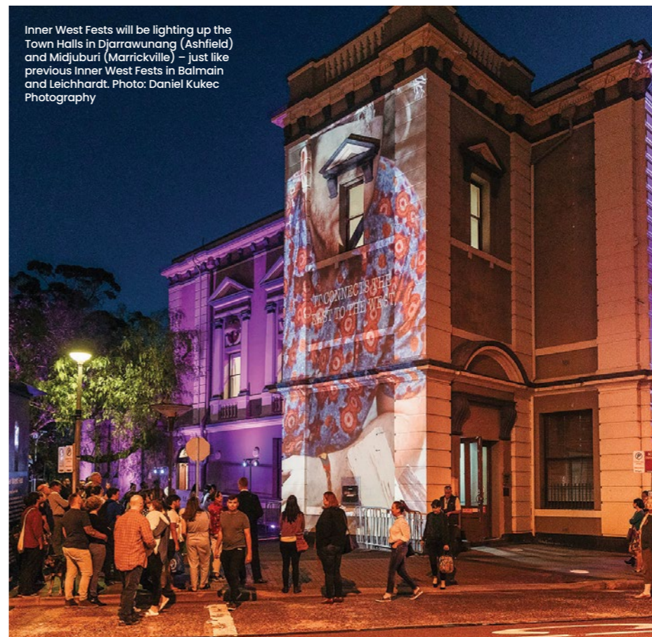
Inner West Fests will be lighting up the Town Halls in Djarrawunang (Ashfield) and Midjuburi (Marrickville) – just like previous Inner West Fests in Balmain and Leichhardt.

Left: Artsabout received a $7,800 Arts Projects grant for The Walking Arts Tour, a permanent audio walk capturing the migrant, industrial and creative histories of Marrickville