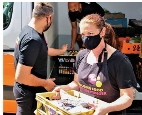
Addison Road Food Pantry is providing food boxes to newly arrived Afghan refugees as well as helping with logistics and administration for families in Afghanistan trying to get out.

Find out how you can help. Go to innerwest.nsw.gov.au/AfghanRefugees