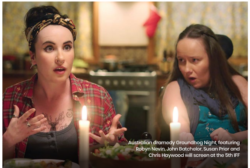
Australian dramedy Groundhog Night , featuring Robyn Nevin, John Batchelor, Susan Prior and Chris Haywood will screen at the 5th IFF

Presented by Inner West Council in partnership with Accessible Arts, PWD and supported by Mable, Exodus and Settlement Services International.