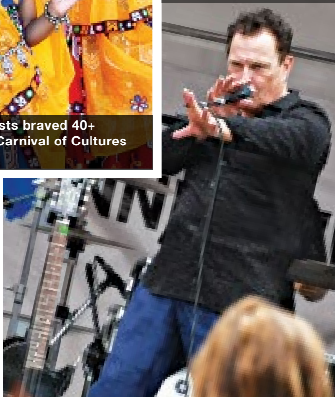
Headliner Ross Wilson (Daddy Cool, Mondo Rock) pulled out all the moves at BluesFest at Leichhardt's War Memorial Park