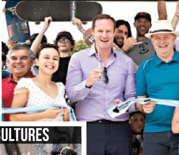
Politicians, skaters and local kids came together under the flight path to celebrate the opening of the new skate space in Sydenham Green