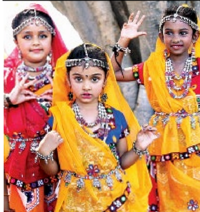
Thousands of enthusiasts braved 40+ degree heat to attend Carnival of Cultures in Ashfield Park