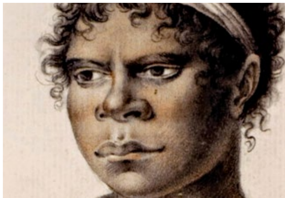
Patyegarang (c 1780s) was an Australian Aboriginal woman from the Cadigal people of the Eora nation. She is thought to be one of the first people to have taught an Aboriginal language to the early colonists in New South Wales