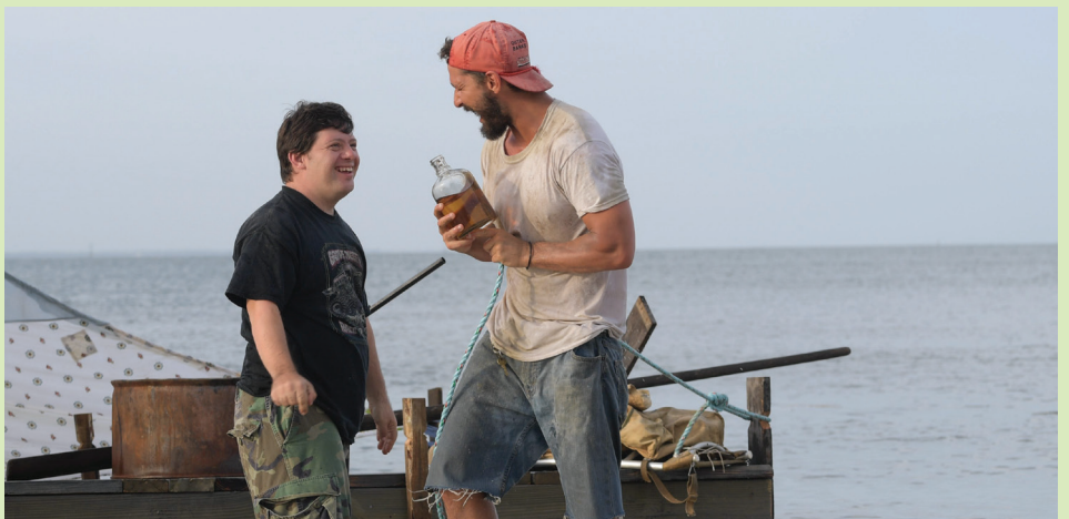
Still from the movie The Peanut Butter Falcon .