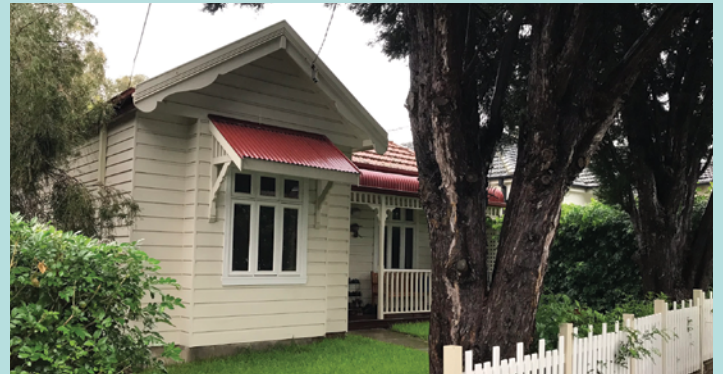
New land valuations were recently sent out by the NSW Valuer General

Owners can object to the valuation if they think it is incorrect. For more information, go to valuergeneral.nsw.gov.au/land_values