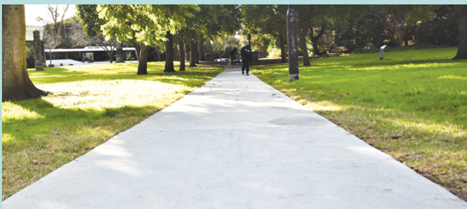
Council has spent $210,000 on renewing footpaths in 14 Inner West parks.

Council identified projects that have a short project delivery timeframe, focused on asset renewal and had previously been prioritised by Council.