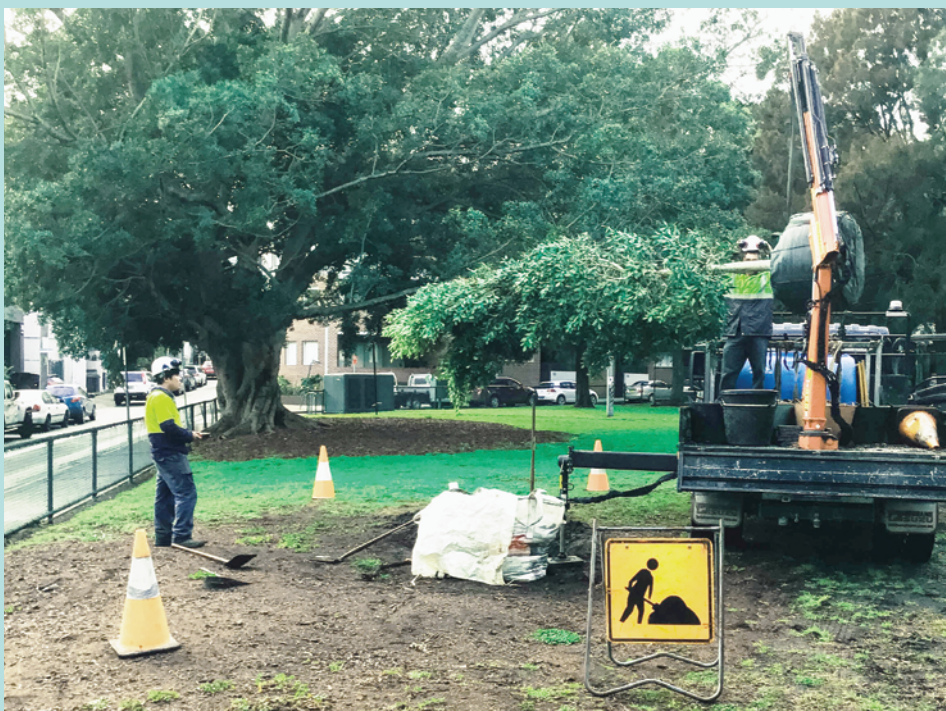
Council will spend nearly $5,000,000 on tree planting this year

Development Applications can be lodged through the NSW Planning portal planningportal.nsw.gov.au