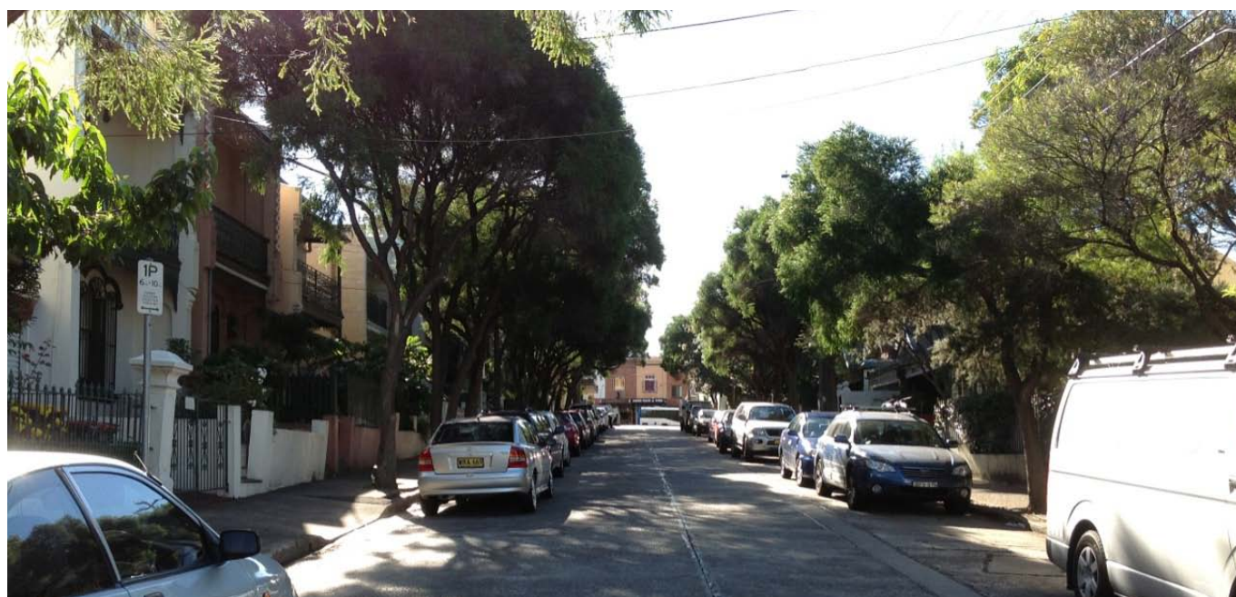
Figure 5.17 - Newtown and Enmore, contains many streets that are narrow and have narrow verges such as Simmons Street. Smaller trees such as Melaleuca bracteata (Black Tea-tree) provide attractive streets and are very appropriate, however this precinct does have a distinct over reliance on this species and Callistemon viminalis (Bottle Brush).